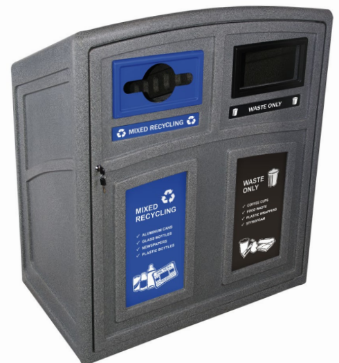
Optional labels available