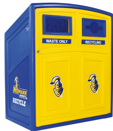
CUSTOMIZE WITH YOUR COLORS/LOGOS