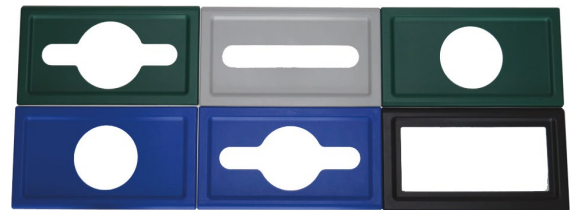
VARIETY OF LID OPENINGS & STAMPING OPTIONS