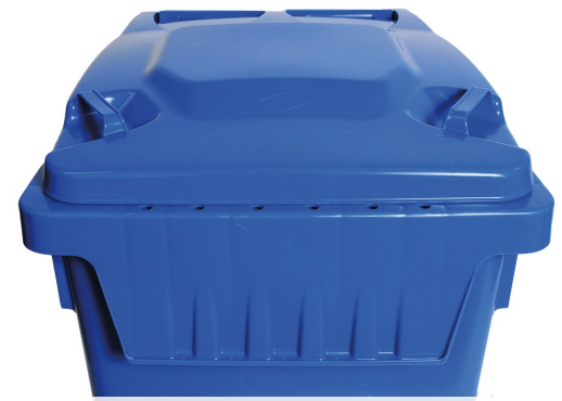
CONTOURED LID REDUCES WARP AND POOLING WATER